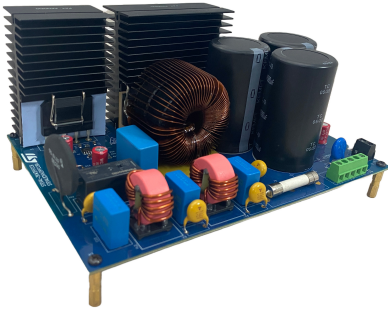
The picture shown is for illustration purpose only. Actual product may vary depending on buyer's selection and availability.