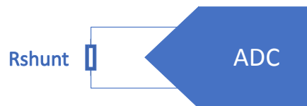
Figure 1. Schematic of the current measurement through a shunt resistor

As the current is calculated using Ohm's law, the shunt resistor value must be precisely known. The user must choose a shunt resistor with a resistance value that produces a voltage drop that is within the range of the instrumentation amplifier or ADC being used for measurement. The voltage drop across the shunt resistor should be large enough to provide a measurable signal, and the measurement must be in the range of \pm 81.92 mV.